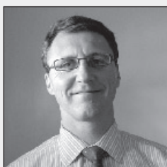
By Chip Gordy

Just about every investment has some type of risk connected with it. The stock market goes up and goes down. A rise in interest rates can cause a fall in the bond market. What about real estate? Too much supply and not enough demand can affect even our most important investment – our primary homes. No matter what you decide to invest your